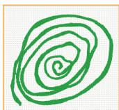
Archimedes spiral drawn by a patient receiving a more effective dose of the same medication.