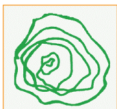
Archimedes spiral drawn by a patient receiving a trial dose of a medication.